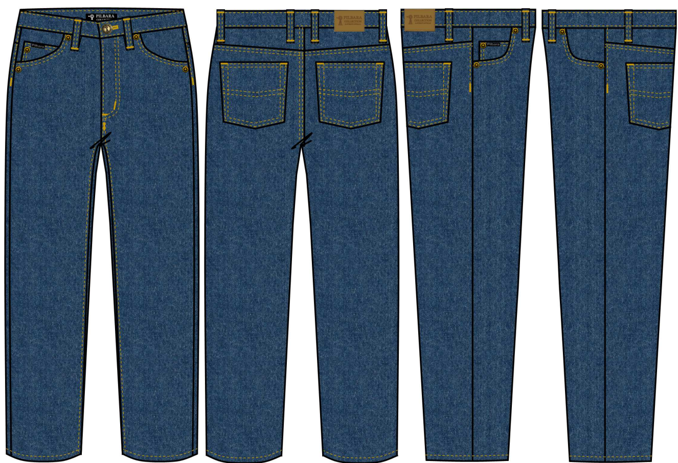
Stone Wash Denim Blue